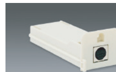
Contact Smart IC chip encoding module