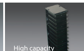
High capacity input hopper