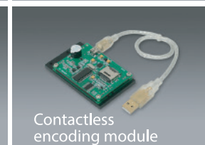
Contactless encoding module