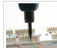
Punch and cut cable terminals