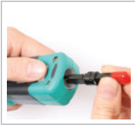
Storage for a spare blade